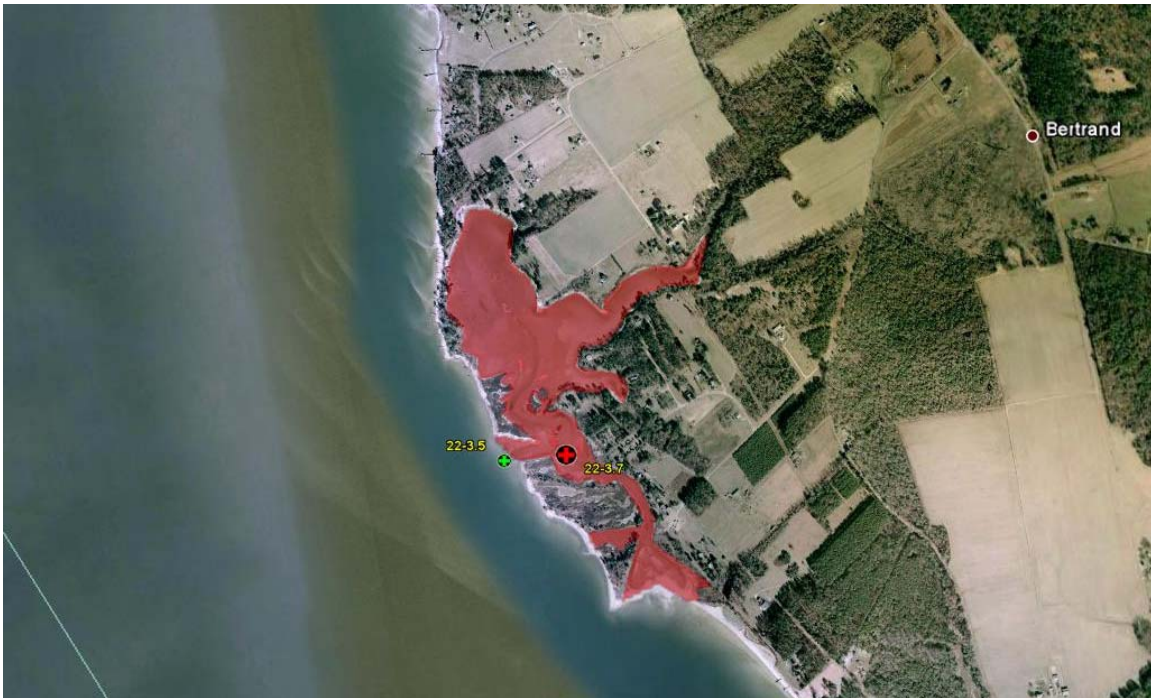
Figure 4. Beach Creek condemnation zone and monitoring sites

Additional monitoring will be conducted by citizen monitors on a yearly basis in partnership with DEQ. Citizen monitors will use Coliscan Easygel to perform monthly monitoring of Escherichia coli ( E. coli ) bacteria. Through comparison studies performed by DEQ, Coliscan has proven to be a good screening tool in estimating E. coli density. In addition, Coliscan Easygel is about 1/10 th the cost of typical laboratory monitoring, allowing for testing additional sample sites in a watershed to identify potential E. coli “hot spots”. Although fecal Enterococcus and fecal coliform are the correct bacteria indicators for salt or brackish water, the citizen provided Coliscan E. coli data may be used to gauge the success of implementation in reducing the amount of fecal bacteria entering the streams. This citizen provided data cannot be used for the purpose of delisting the streams based on observed improvements.