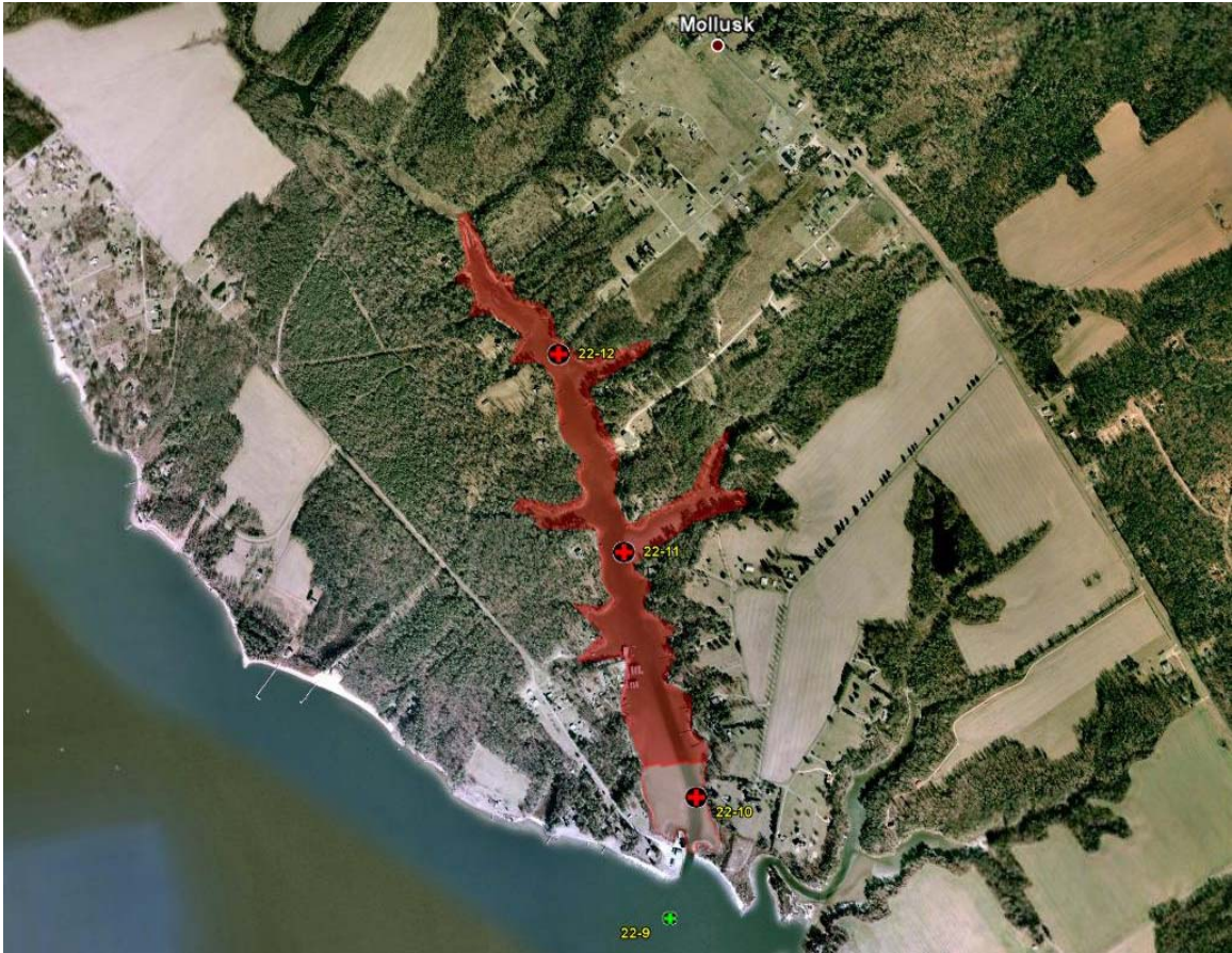
Figure 2. Greenvale Creek condemnation zones and monitoring sites