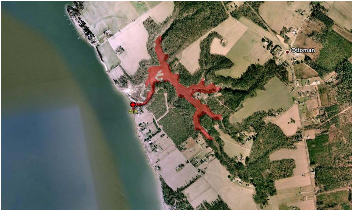
Figure 3. Paynes Creek condemnation zone and monitoring site